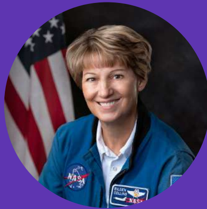
Colonel Eileen Collins

Guest Speaker VP, Principal Analyst at Forrester