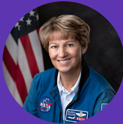
Colonel Eileen Collins

Guest Speaker VP, Principal Analyst at Forrester